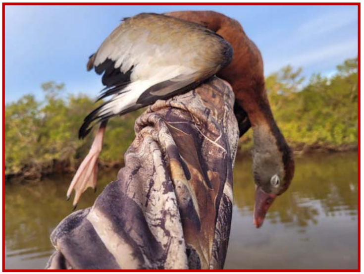
Earlier that morning, we were blessed with flights of Black Bellies. Flocks, singles, doubles...

All I could think was well, this is hunting... put on the smile... as I had a LOT to be happy about. I did my best not to let that tarnish another amazing Mexico hunt. But the sting was real.