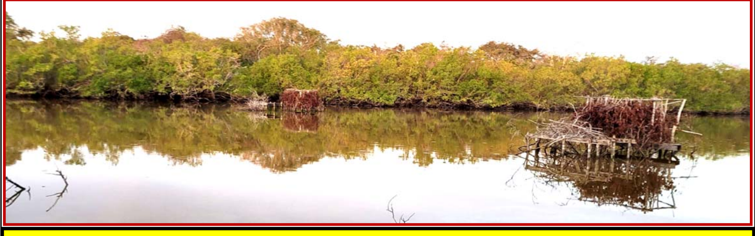
The Scene — Blinds in Shallow Water Surrounded by Mangrove Trees