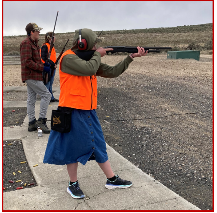
Clubhouse (near Potholes State Park — 6897 Hwy 262 SE Othello, WA for GPS purposes).

The next quarterly meeting of the Moses Lake Chapter of WWA will be held on Thursday, May 26, 2022 beginning at 6 pm at the O'Sullivan Sportsman Resort