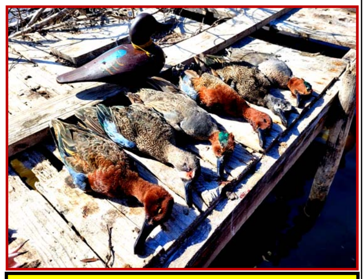
Second Set of Dual Teal Slams & the Decoy from Home